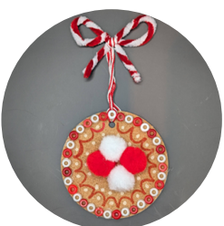
3/3 - Spring Charms Design your own charm.

Most appropriate for kids in grades K-6.