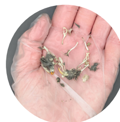
3/17 - Owl Pellets Dissect an owl pellet.