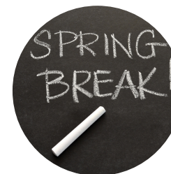
3/24 - NO DROP IN