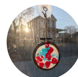
3/31 - Sun Catchers Make a crayon sun catcher.